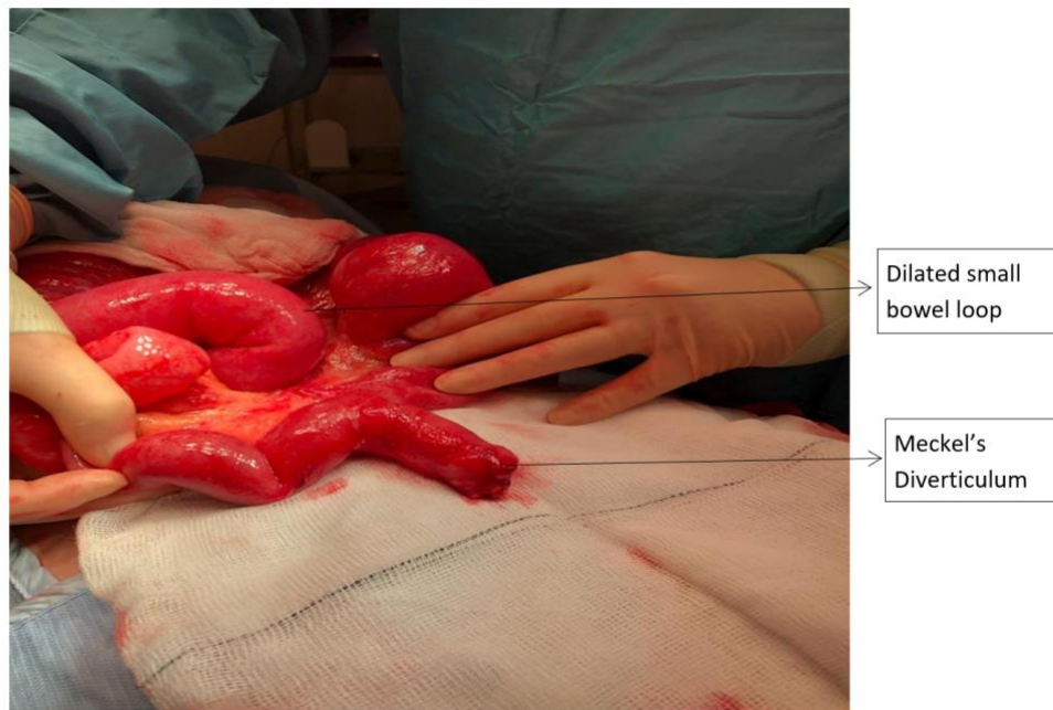
Figure 2: Intra-operative picture showing Meckel's diverticulum.

(Figure 2). The diverticulum was adherent to the fundus of the pregnant uterus. The small bowel was mobilised, and the Meckel's diverticulum was resected with a 60 mm transverse Linear Cutter stapler. The staple line was over sewn with 3-0 Polydioxanone suture.